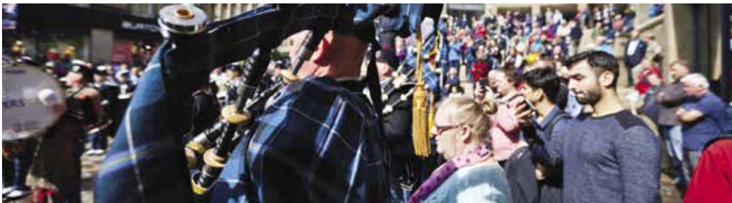
Pipe Band on Buchanan Street

Competition League of Amateur Solo Pipers – World Championship Grade 2. For more information visit www.theclasp.co.uk FREE