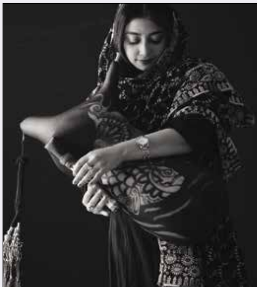
Lian Music Band

Hear the first professional female piper from Iran with her band.