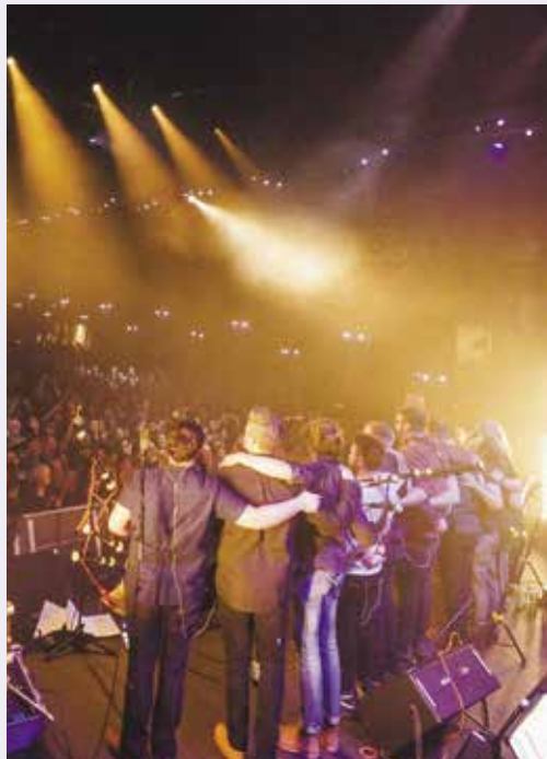
RURA at Old Fruitmarket.