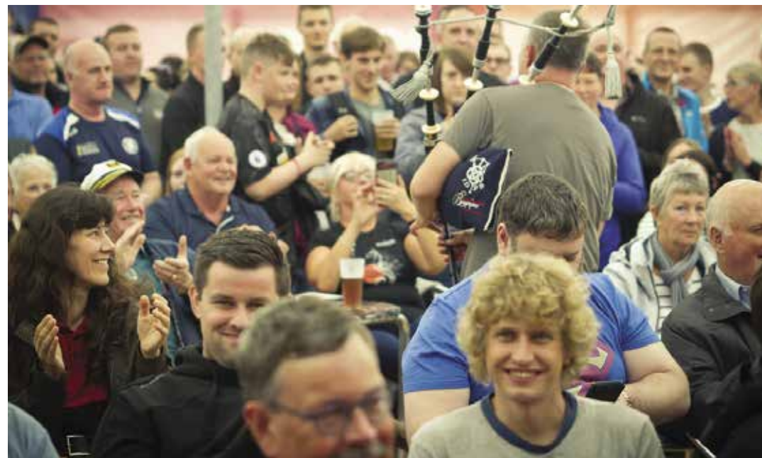
McCallum Bagpipes in the Sreet Café

Competition League of Amateur Solo Pipers championship – Grade 1. For more information visit www.theclasp.co.uk