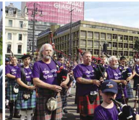
Piping Live! Big Band