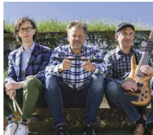
Blarvuster (Playing 7.30pm Ceol Nua concert)