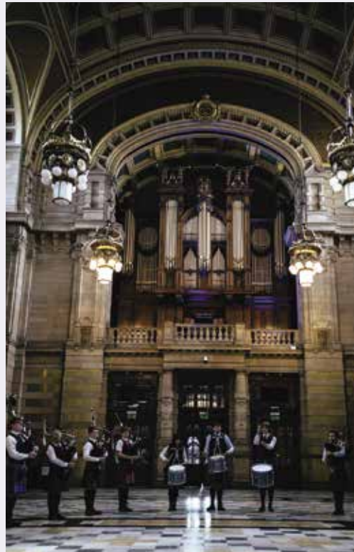
Pipe Band in Kelvingrove Centre Hall