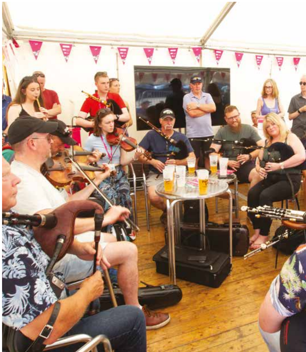
Session in 2022 Street Café.

Round out the week with some great tunes, fantastic food and a few drinks. We will have a great session going all afternoon so bring your instrument to join in or head down to relax and enjoy the music! FREE