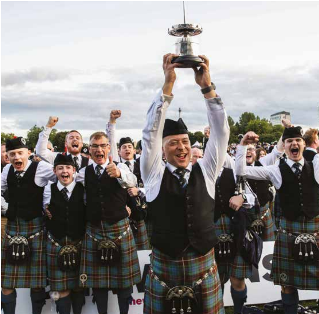
World Pipe Band Champions.

Adults from £22.50 (£17), book in advance for the best price.