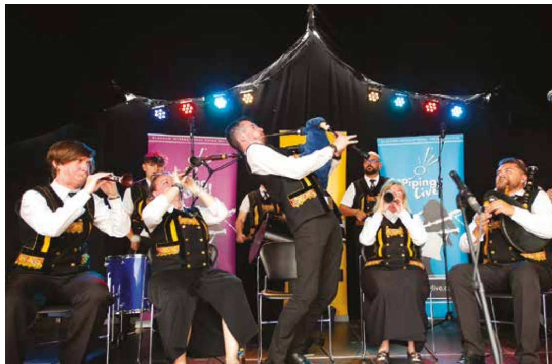
Bagad Brieg at the Street Café in 2023.