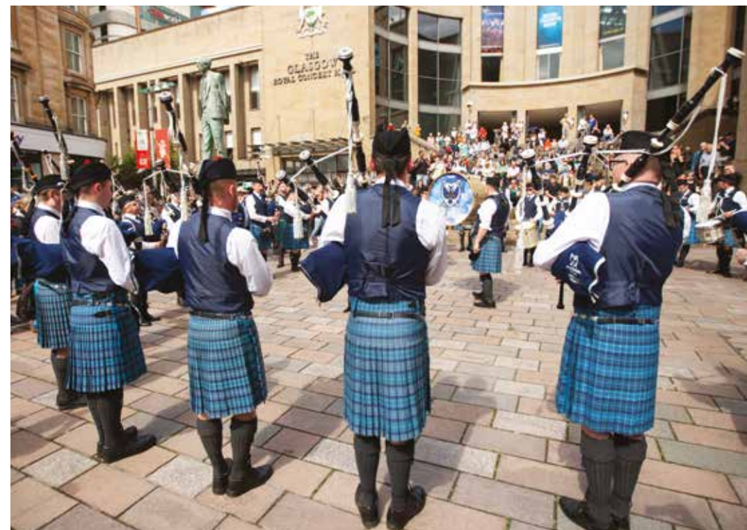
Buchanan Street Pipe Band.