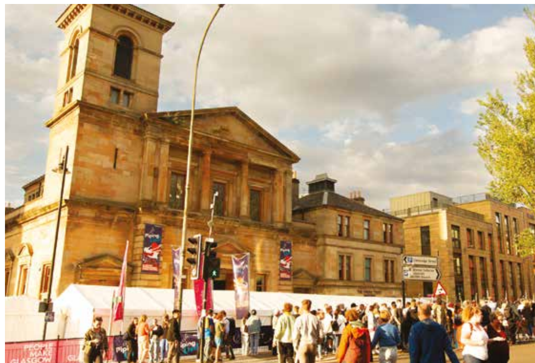
The National Piping Centre and Street Café.